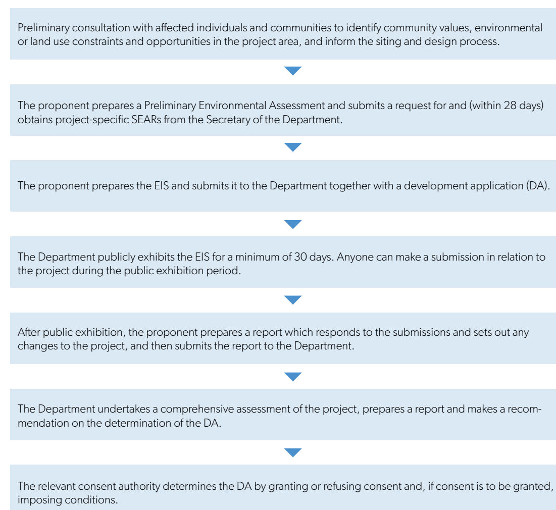
Figure 1. Summary of the typical assessment and approval process for SSD

The Department's Planning Circular PS 11-014 Assessment of State significant development and infrastructure (2011) contains additional information on SSD processes.